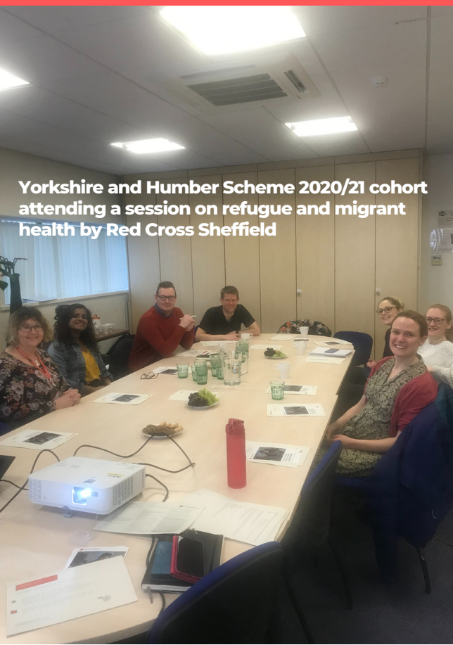
Yorkshire and Humber Scheme 2020/21 cohort attending a session on refugee and migrant health by Red Cross Sheffield

It isn't easy to work in areas of deprivation, but it is incredibly rewarding. We need GPs with the passion and desire to improve the health of vulnerable and marginalised patients.